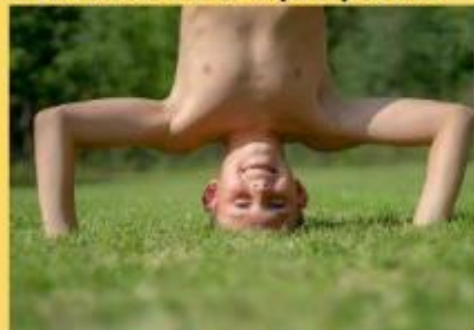
Look from a new perspective