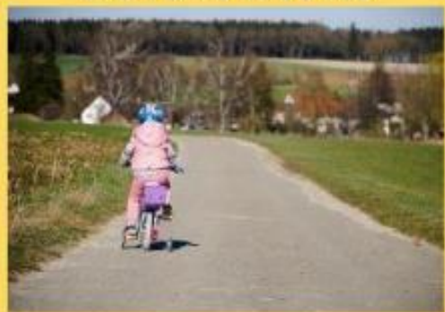
Learn some new tricks