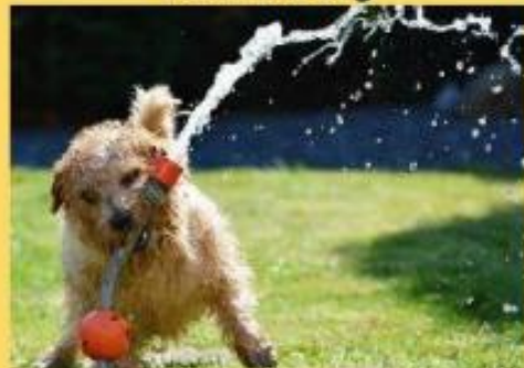
Wash the dog