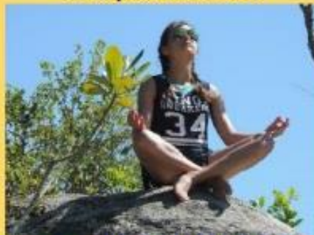
Find your inner self