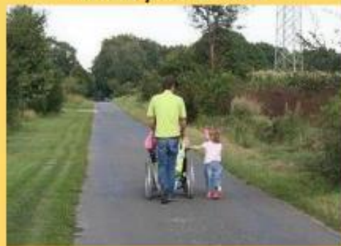
Whizz your wheels