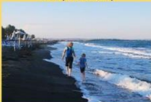
Love your locality