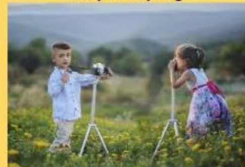
Snap the Spring