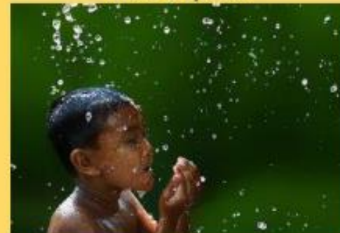
Make a splash