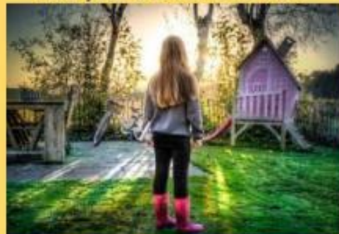
Take your wellies for a walk