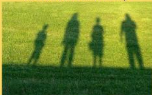
Walk and talk with family