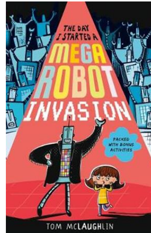
The Day I Started a Mega Robot Invasion

Three stories about Tola, a Nigerian girl that lives in a flat with her big family. Her sister Bola is very clever, her brother Femi is very fast and Grandnanny is very bossy.