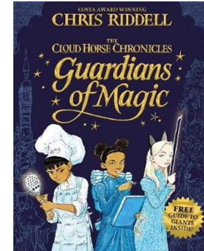
Guardians of Magic By Chris Riddell

A picture book inspired by the environmental message of Greta Thunberg. When giants destroy the forest, Greta knows she has to help the animals that live there! But how? The book's even printed on recycled paper